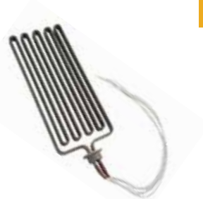
Flat bar element